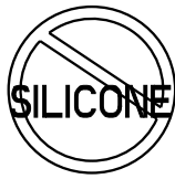
PLATE NON-REPLACEMENT PART

LUBRICATE ALL SEALS WITH CLEAN HYDRAULIC OIL PRIOR TO ASSEMBLY. DO NOT USE SILICONE BASED LUBRICANTS.